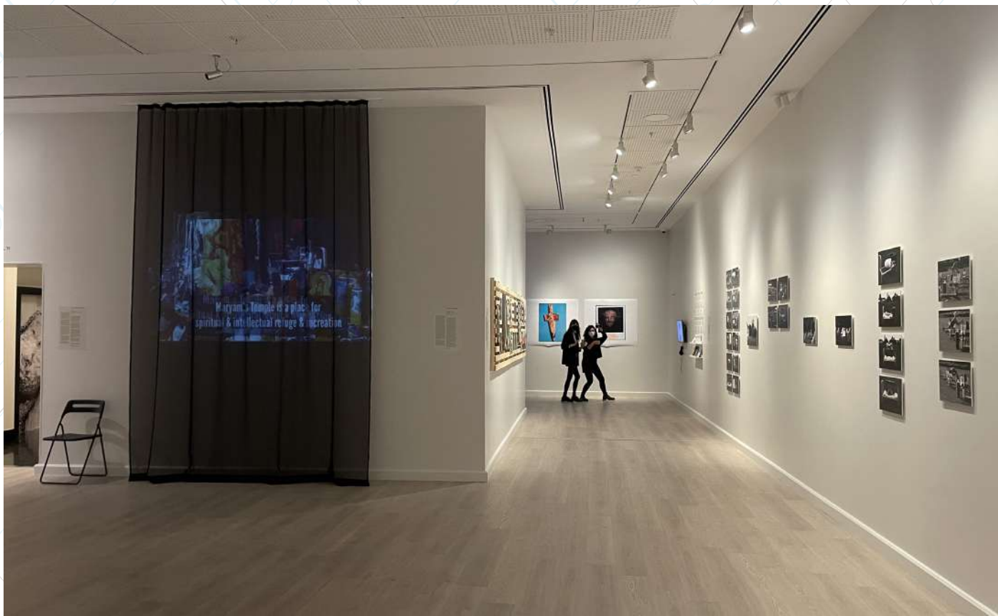
NOTES FOR TOMORROW at Pera Museum-Istanbul-Turkey