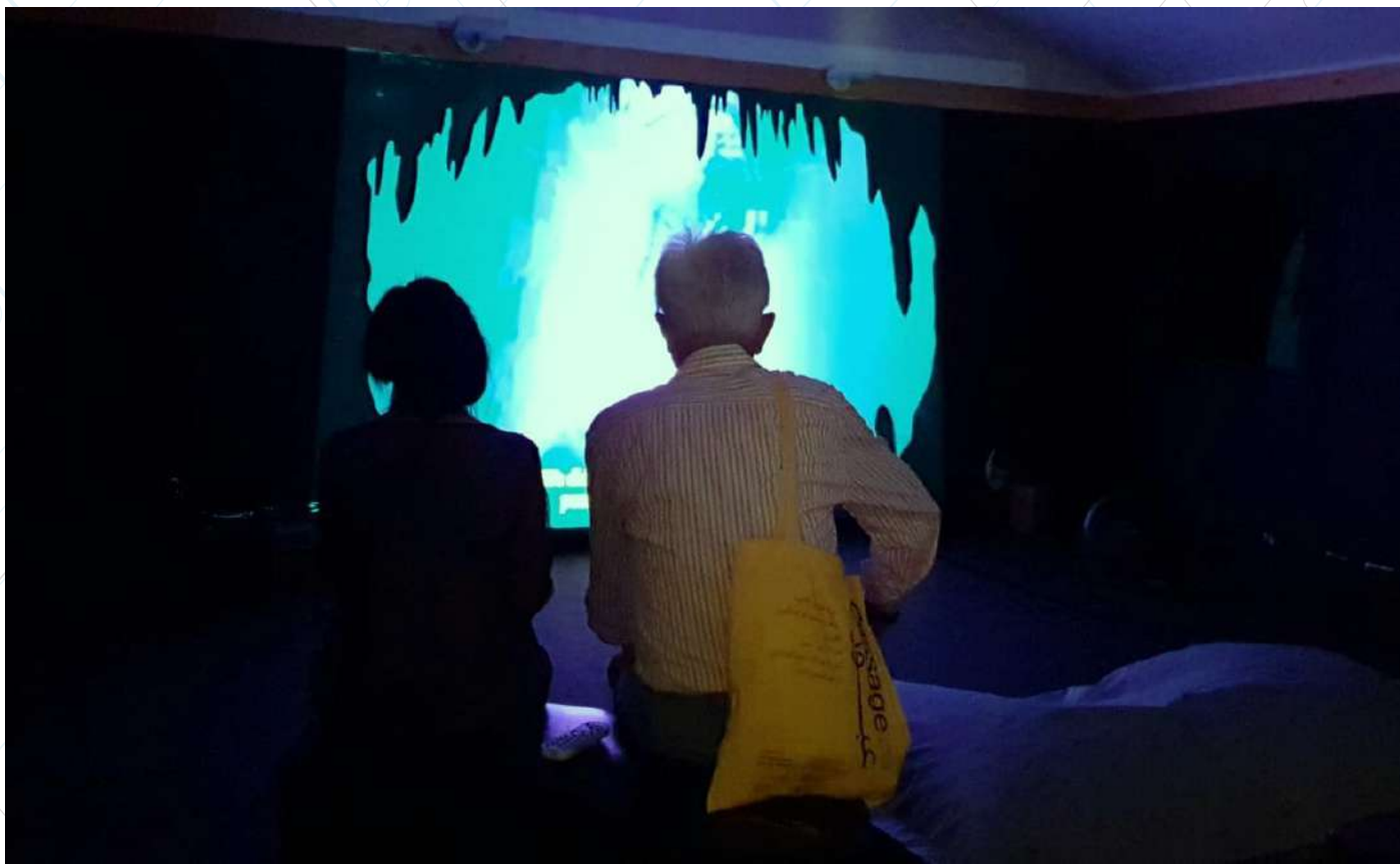
Darwin Darwah by Arash Nassiri, ANECDOTES ON ORIGIN EXHIBITION at A plus A Gallery, Venice - Italy Photos credit: Courtesy of Giambattista, 2019