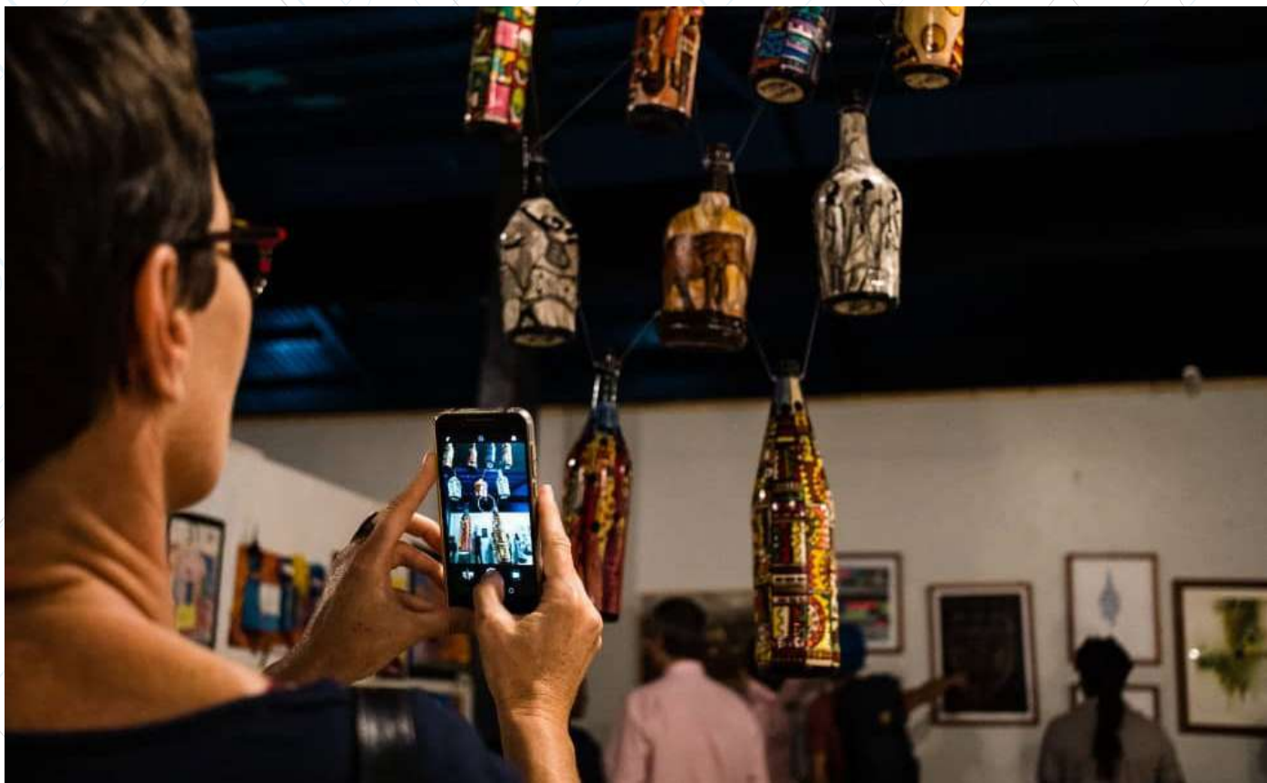
Chris Bigomba Bottle installation, ART CREATES WATER #2 at Design Hub, Kampala-Uganda