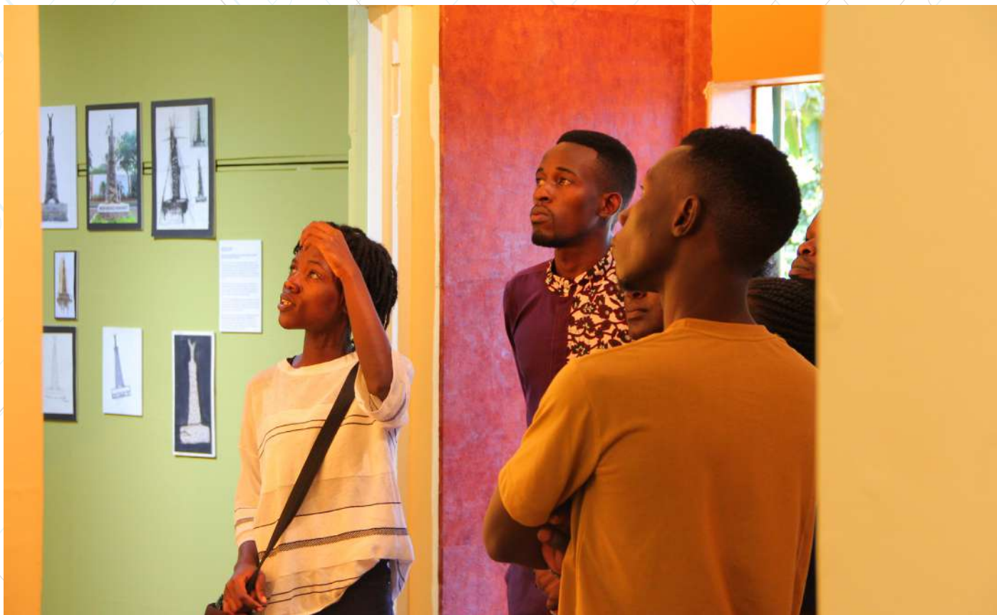
Curatorial team of TRACING THE QUE-RATOR at Nommo Gallery, Kampala-Uganda