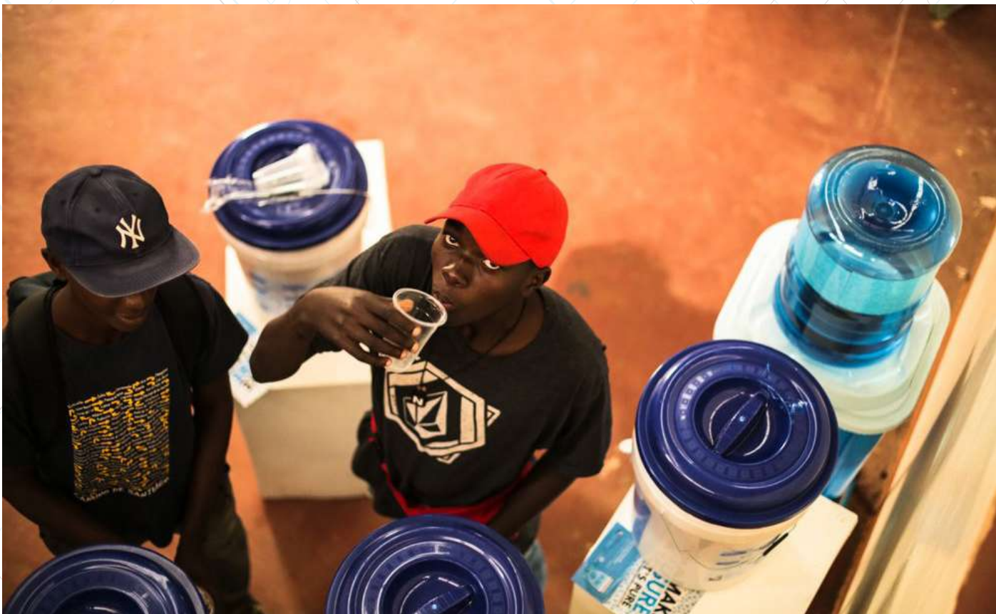
Water Purifier installation, ART CREATES WATER #3 at Uganda Museum, Kampala-Uganda