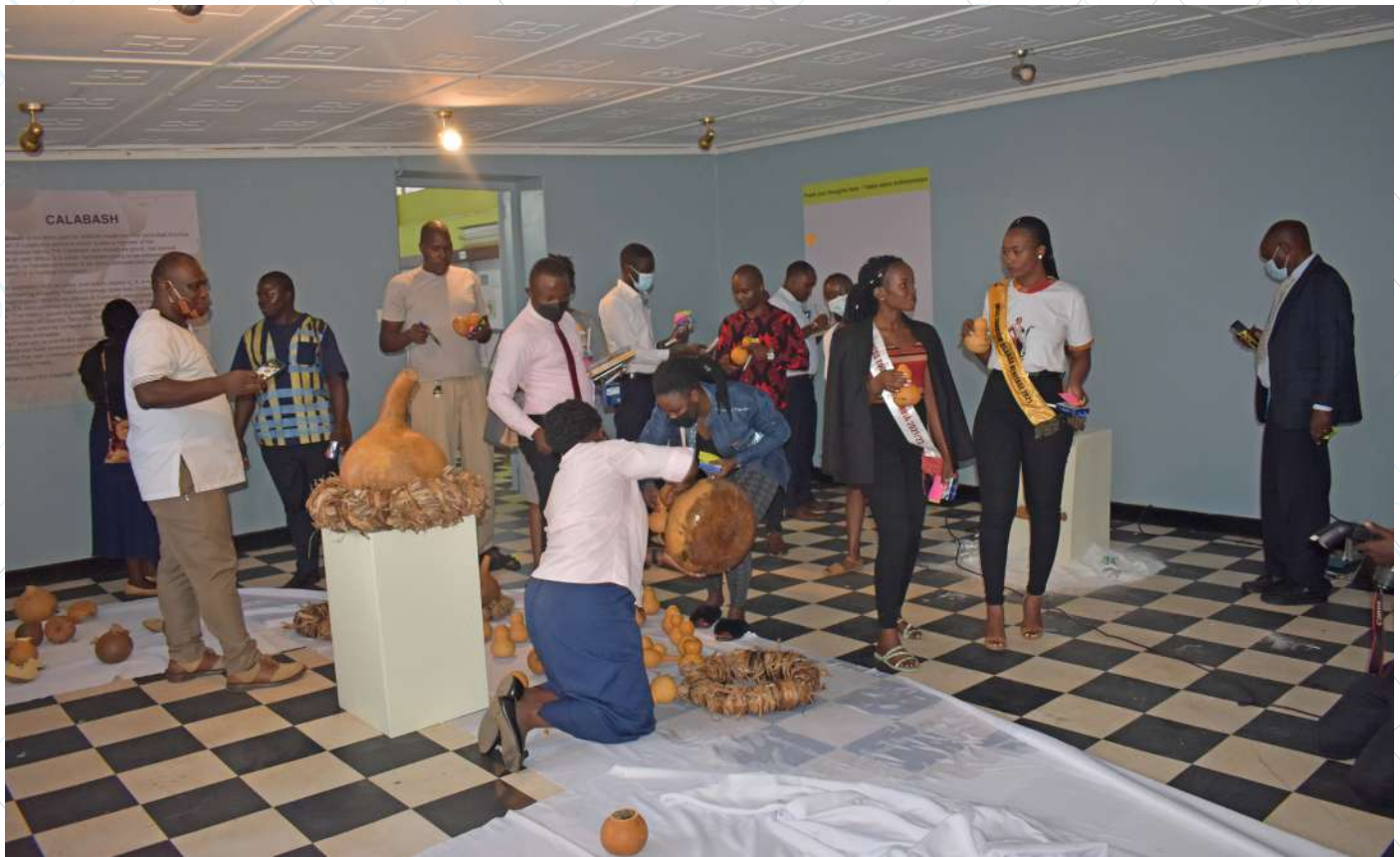
FACING OUR PAST: RETHINKING FUTURE MUSEUMS at Uganda Museum, Kampala-Uganda