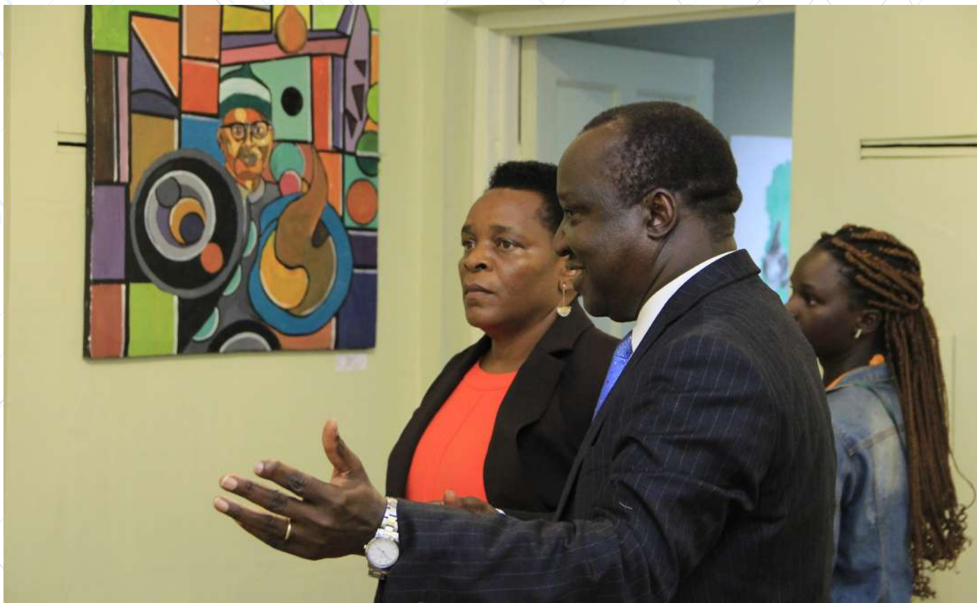
MY IMPRESSION ART EXHIBITION at Nommo Gallery, Kampala-Uganda